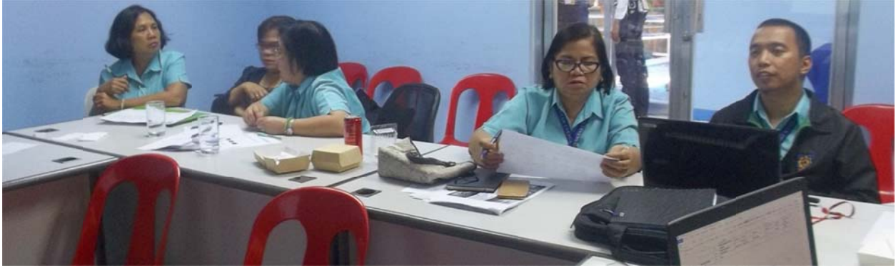
Records Management Division / EPIMB / EUMB