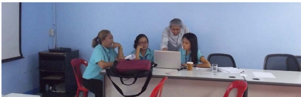
AS – Procurement / Supply Divisions