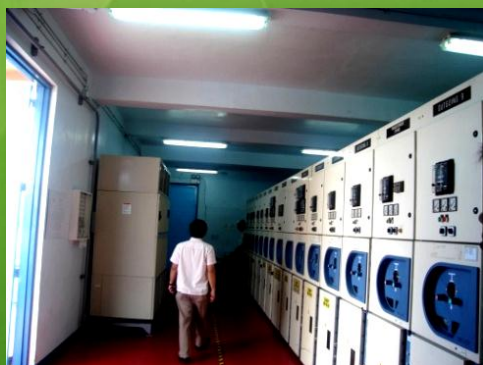
CIP II Power Corporation (La Union) 21 MW Bunker C fired power plant