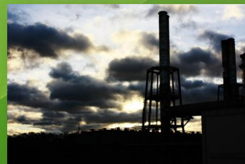
SEM Calaca 15 MW of the Coal Power Plant