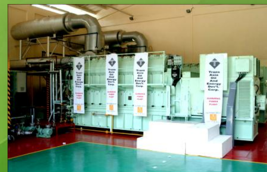
Guimaras Power Plant 3.4 MW Bunker C fired power plant