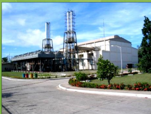
Trans-Asia Power Generation Corp. (Bulacan) 52 MW Bunker C fired power plant