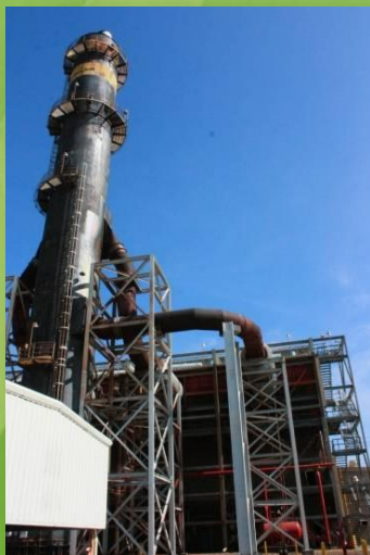
One Subic Power Generation Corporation 110 MW Bunker-fired Power Plant