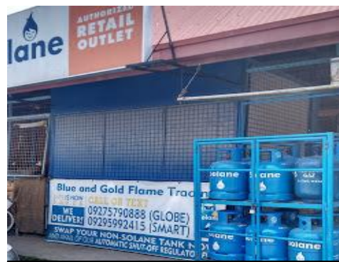
LPG Dealer / RO