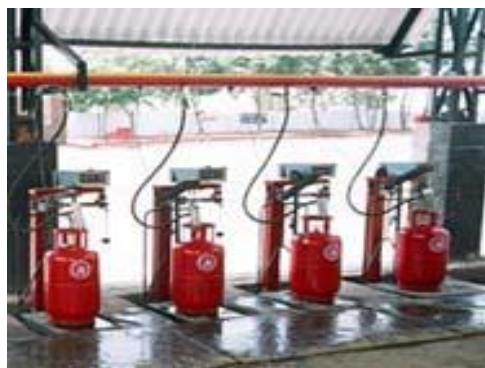
LPG Refilling Plant