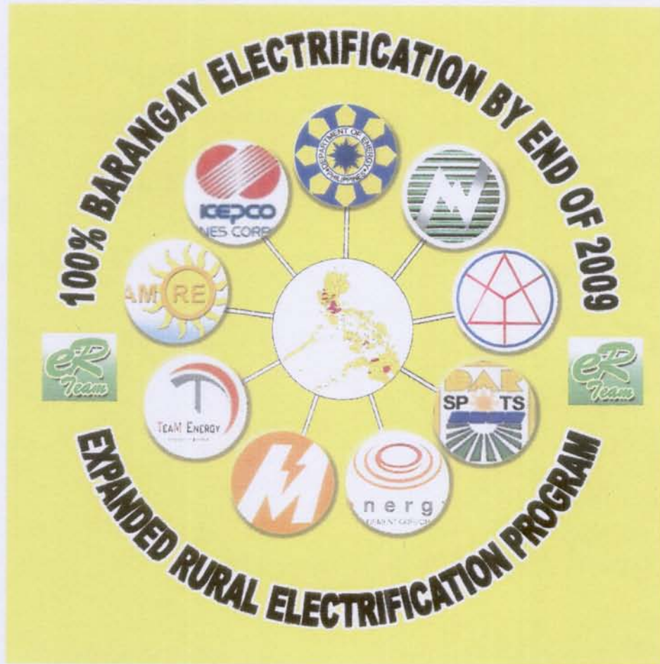
Logo indicates public and private sector participation with the Department of Energy (DOE) as the Lead .